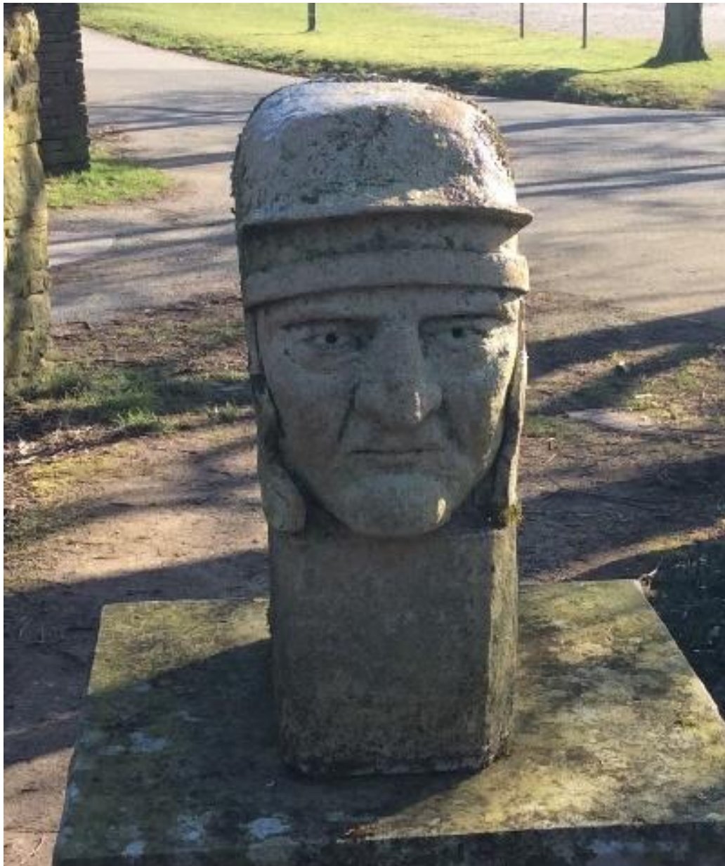
2 Roman Legionary

3 Pass through the golf course, keep straight ahead on the road towards the clubhouse but do not go to the clubhouse. Follow this road round to the left downhill and continue out of the grounds, past Linnet Clough Scout Camp. The path descends a rough track and reaches a rough road near Bottoms Hall Farm. Turn left at the junction near the site of Bottoms Mill (more information boards). Go over Bottom's bridge and a short way up the hill turn right through the entrance to the Garden House and along the riverside path (not a right of way but allowed by the Garden House) to the back of the Midland pub and Brabyns Brow, Turn left uphill back to the station.