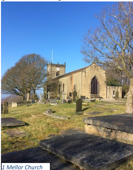
1 Mellor Church

2 Turn right at Ley Lane by the Hare and Hounds and follow the road. Ignore lanes to the right (weak bridge) and left (access only). After about 300 m you will cross a stream and immediately turn right onto a footpath at a signpost. The path curves upwards to the left and eventually becomes indistinct. Walk towards a stile and footpath marker ahead across the stile. Keep the fence to the left which leads towards Mellor Hall high up on the hill. This section can be very muddy, and the path is not clear though the Hall is easily seen. Keep to the left as you climb (very steep) and approach the Hall by a narrow passage. (Note that about half-way up the climb a gradually rising path goes off to the right – this can be followed to Mellor Church if the Hall is to be missed